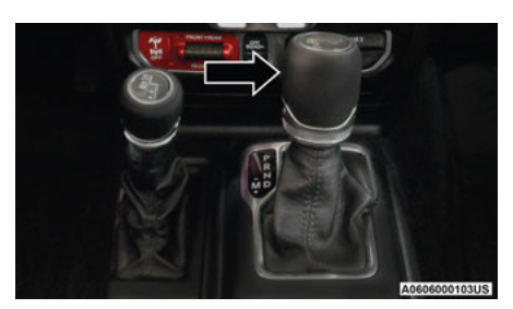
Transmission Gear Selector

The transmission gear selector provides PARK, REVERSE, NEUTRAL, and MANUAL (M) (AutoStick) shift positions. Manual shifts can be made using the AutoStick shift control. Toggling the gear selector forward (-) or rearward (+) while in the MANUAL (AutoStick) position (beside the DRIVE position), or tapping the shift paddles (+/-), (if equipped) will manually select the transmission gear, and will display the current gear in the instrument cluster ♀ page 11.