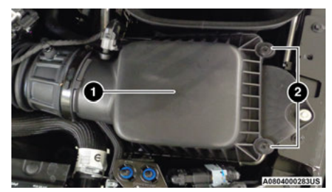
Engine Air Cleaner Cover

1. Loosen the fasteners from the air cleaner cover using a suitable tool.