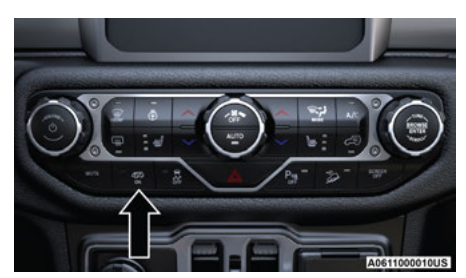
Dual Mode Exhaust Button

This vehicle is equipped with a dual-mode exhaust, designed to provide both quiet cruising and sporty sound. The system has two modes, Performance Exhaust ON and Performance Exhaust OFF. A button on the dashboard can be used to toggle between settings, and the light illuminates when "Performance Exhaust ON" mode is active. In this mode, the exhaust valves are commanded fully open to deliver a deep, sporty sound. A message appears momentarily in the instrument cluster whenever the exhaust oFF" setting is active, the exhaust valves are closed except at high engine speeds and loads, when they are commanded open without notification.