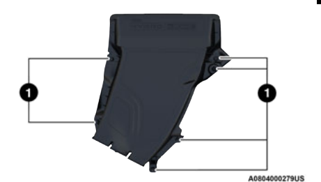
First Water Separation Chamber

Loosen the six captured fasteners from the first water separation chamber using a suitable tool.