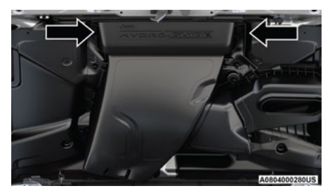
First Water Chamber Removal

2. Pull on the hood duct at the top to disengage the push pin clip along with the rubber grommet and remove from vehicle.