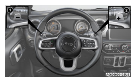
Steering Wheel Mounted Paddle Shifters

AutoStick is a driver-interactive transmission feature providing manual shift control, giving you more control of the vehicle. AutoStick allows you to maximize engine braking, eliminate undesirable upshifts and downshifts, and improve overall vehicle performance. This feature can also provide you with more control during passing, city driving, cold slippery conditions, mountain driving, trailer towing, and many other situations.