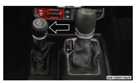
Four-Wheel Drive Gear Selector

The transfer case provides four positions: