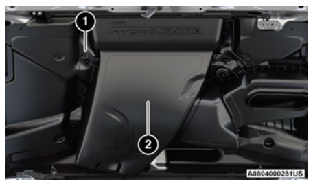
First Water Separation Chamber

1. Locate the first water separation chamber to hood/second chamber then engage the push pin clip and grommet.